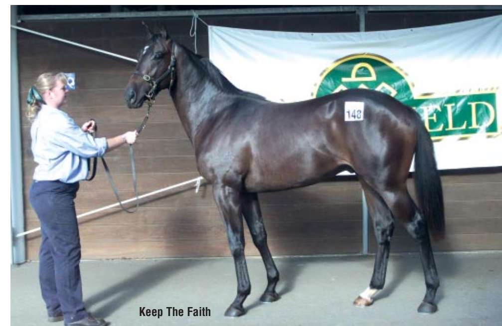
Keep The Faith

$1,400,000: CRITICAL LIST (Danehill (USA)/Verocative) was purchased by Gooree Stud at the Magic Millions Premier Sale.