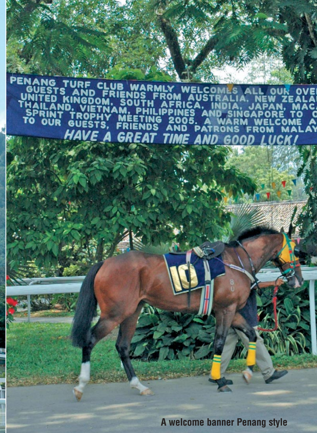
A welcome banner Penang style