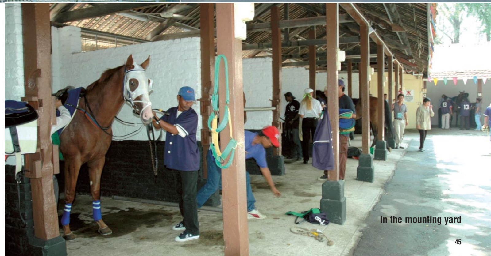
In the mounting yard

It has been disease that has posed some of the biggest challenges to the country's racing however. Singapore imposed a ban on the movement of horses from Malaysia to Singapore following the outbreak of the Nipah virus in Malaysia in 1999. There have also been more recent issues with strangles. Malaysia has therefore largely been left on its own. PTO