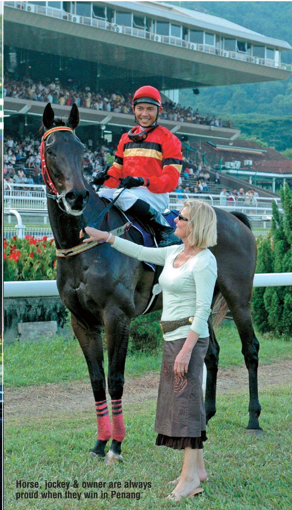
Horse, jockey & owner are always proud when they win in Penang