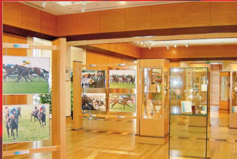
Nad Al Sheba Museum