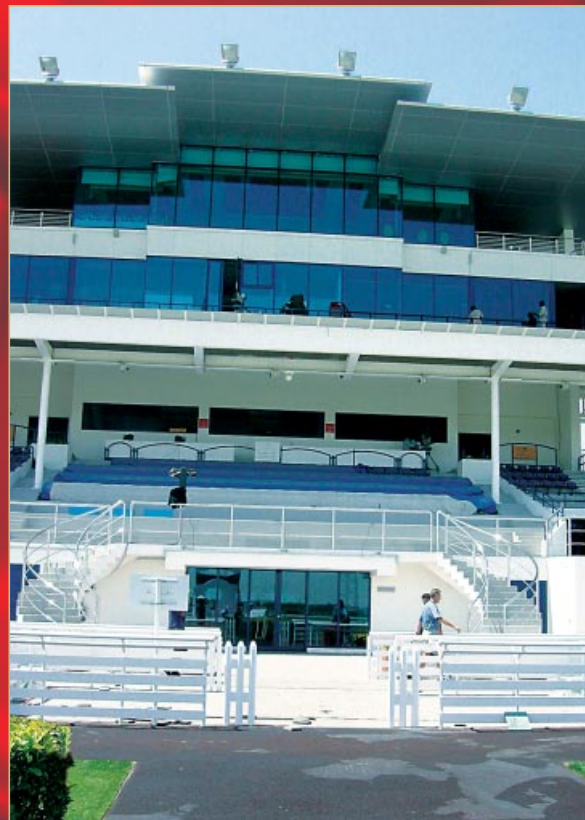
The Main Grandstand