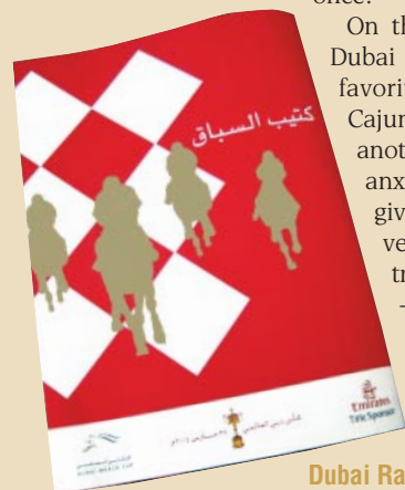
Dubai Race Book

It's the first dead heat in the history of the event; another story for the glittering vault of the Dubai World Cup Carnival.