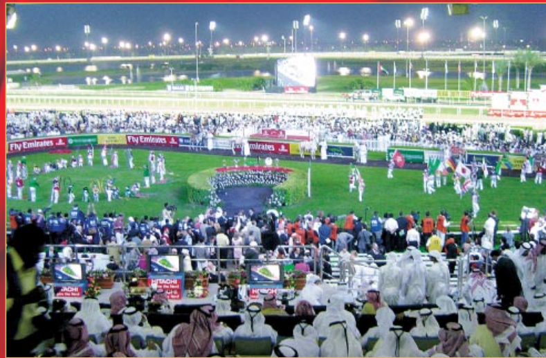
Pre race entertainment