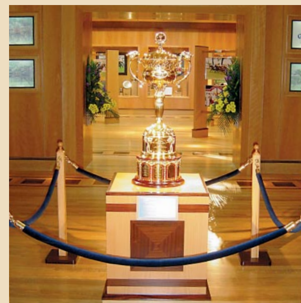
Dubai World Cup

The stand in front of me overflows with the crisp white dish-dasha of the Sheikhs and Saudis.