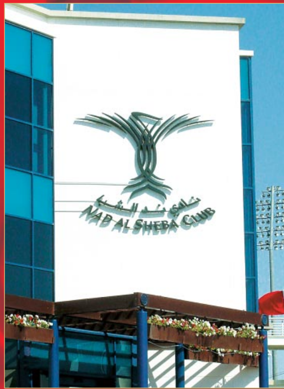
Outside Nad Al Sheba Track